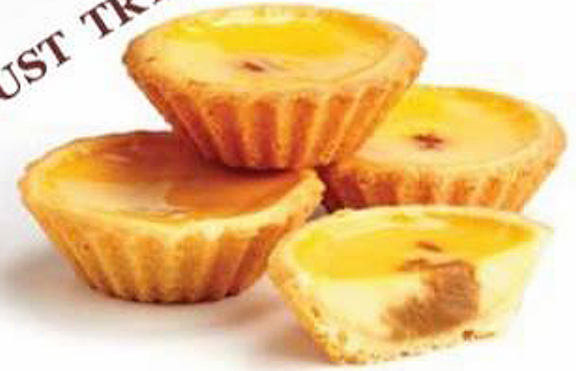
Hainanese Gula Melaka Egg Tart 海南洋人棕榈蛋挞