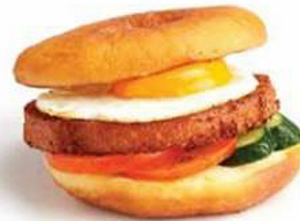
Donut Spam & Egg Burger 午餐肉鸡蛋甜甜圈汉堡 ala carte $5.80 set $7.30