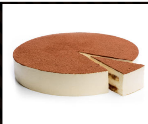
TIRAMISU SLICE $7.5