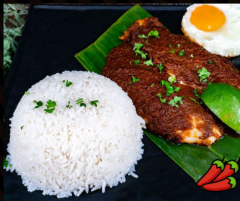
SAMBAL SNAPPER SET $16.0