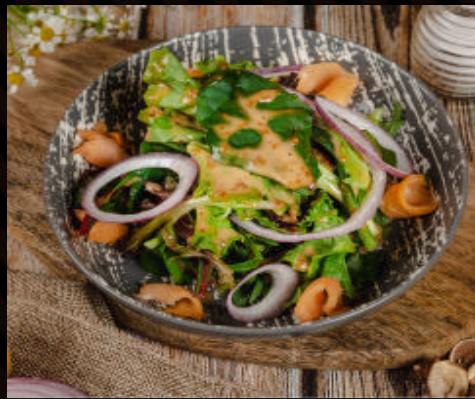
SMOKED SALMON SALAD $9.9