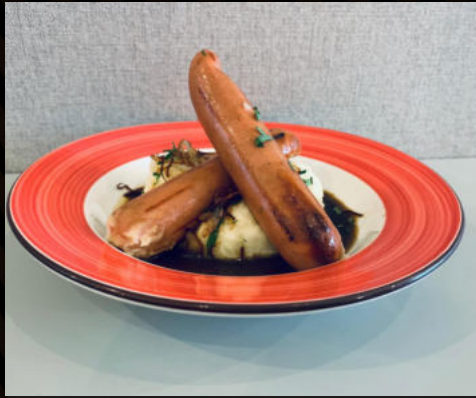
BANGER & MASH $14.9