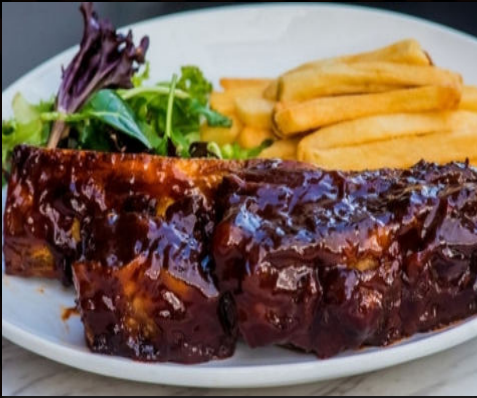
ANGUS BEEF RIBS $49.9