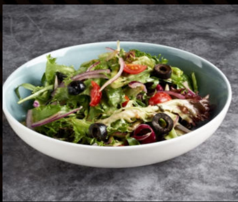
GARDEN SALAD $8.0