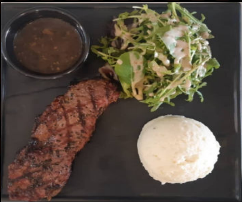
NEW YORK STRIP (300g) $24.9