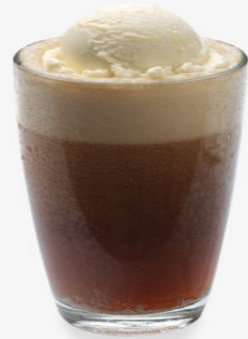
ICE CREAM FLOAT + $2.0