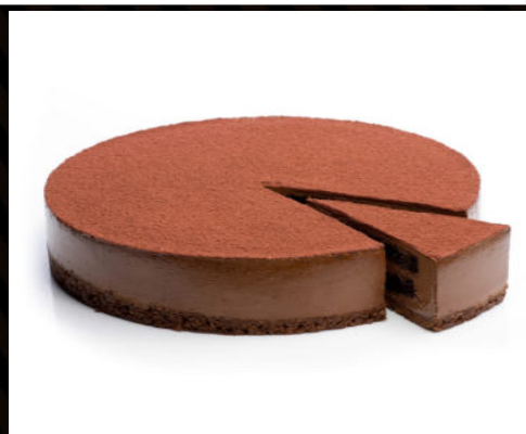
CHOCOLATE SLICE $7.5