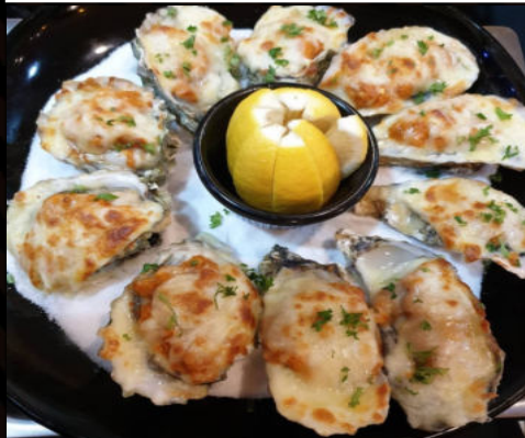
BAKED OYSTERS (1/2 DOZEN) $39.90 (1 DOZEN) $59.90