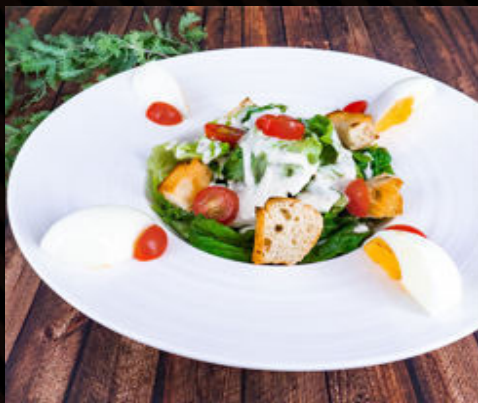
CAESAR SALAD $8.9