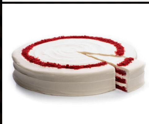
RED VELVET SLICE $7.5