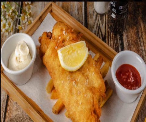
FISH N CHIPS $18.0