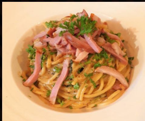
CREAMY SMOKED DUCK