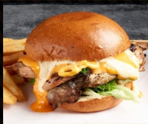
CHEESY GRILLED CHICKEN