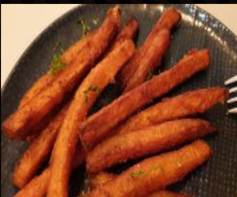
SWEET POTATO FRIES