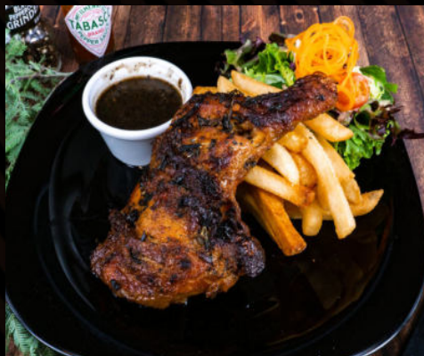
ROTTISERIE CHICKEN $17.0