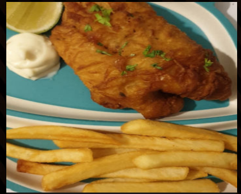
LITTLE FISH & CHIPS $8.0