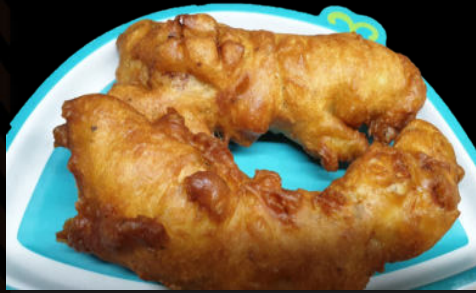
CHICKEN FINGERS $8.0