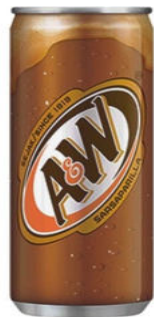
ROOT BEER $3.0