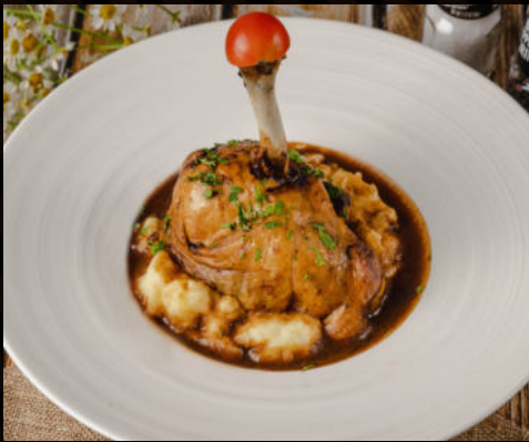
CHICKEN DE GLAZE $19.0