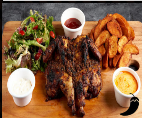
CHICKEN DIAVOLA $32.9