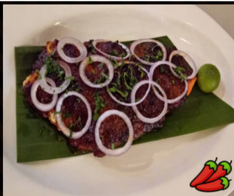
SAMBAL SNAPPER $11.9