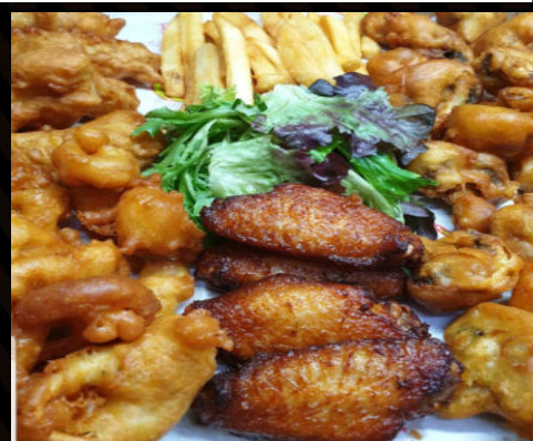
GOLDEN PLATTER $27.0