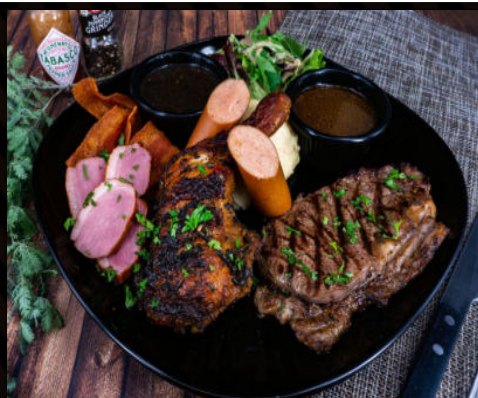
LE BUTCHER'S PLATE $37.0