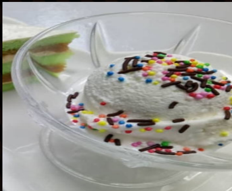
ICE CREAM 1 SCOOP $3.0