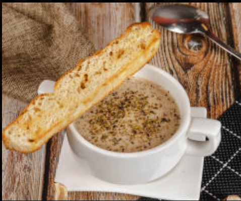
CREAM OF MUSHROOM $6.0