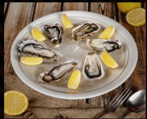
OYSTERS (HALF DOZEN) $29.90 (1 DOZEN) $49.90