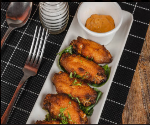
BUFFALO WINGS (6pcs)