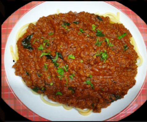
PASTA BOLOGNESE $8.0