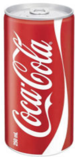
COKE/ COKE ZERO $3.0