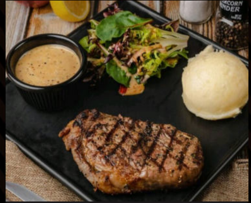
RIBEYE STEAK (200g) $29.9 (425g) $45.0