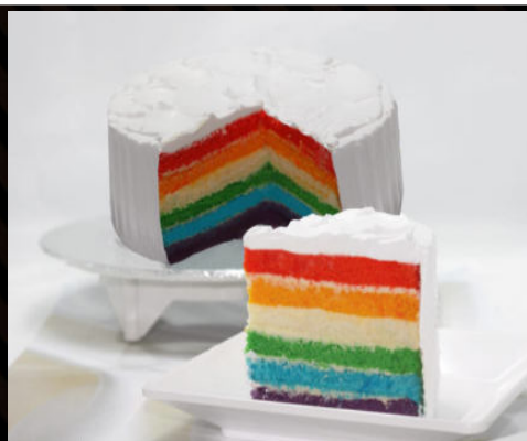
RAINBOW SLICE $7.5