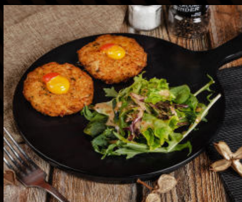
CRISPY CRAB CAKE