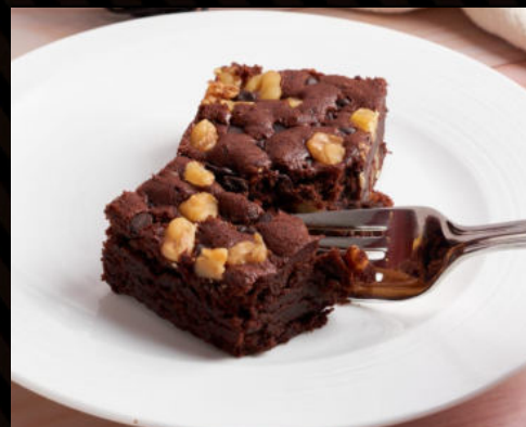
BROWNIE $5.0 BROWNIE w ICE CREAM $7.5