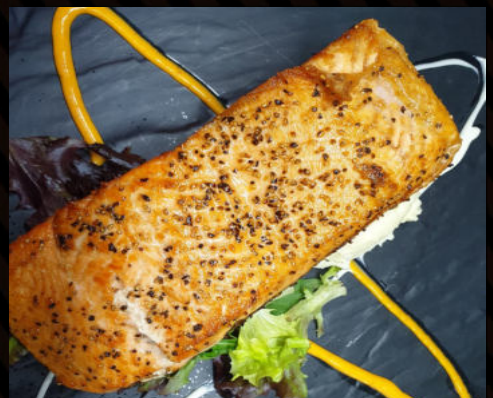
PAN SEARED WILD SALMON $20.0