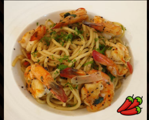
CLASSIC AGLIO OLIO