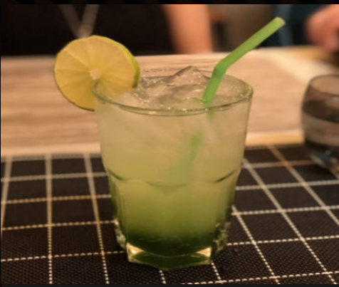
KIWI CUCUMBER LIME