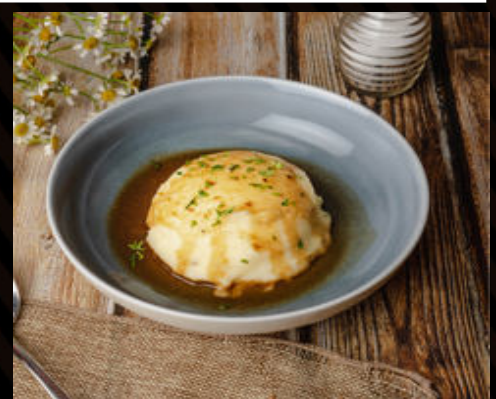
HOMEMADE MASH $5.0