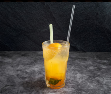
PEACH MANGO BASIL