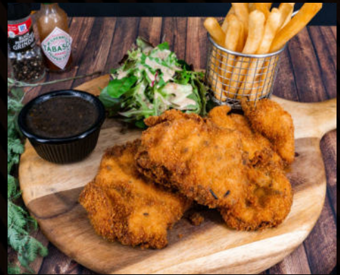
CHICKEN CUTLET $17.0