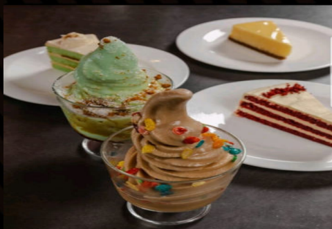
SALTED CARAMEL SOFT SERVE $6 ONDEH ONDEH SOFT SERVE $6