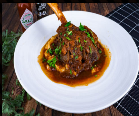
BRAISED LAMB SHANK $22.9