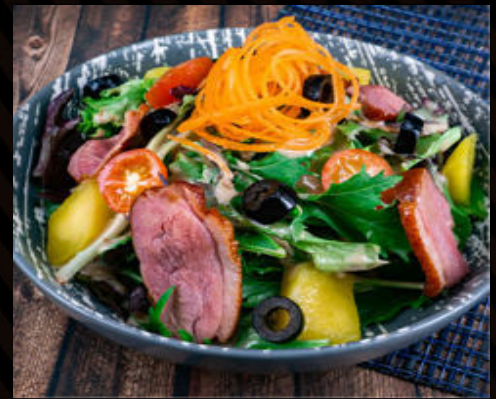
SMOKED DUCK SALAD $9.9