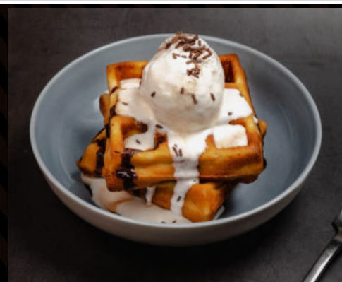
WAFFLES WITH ICE CREAM $12.0