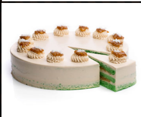
ONDEH SLICE $7.5